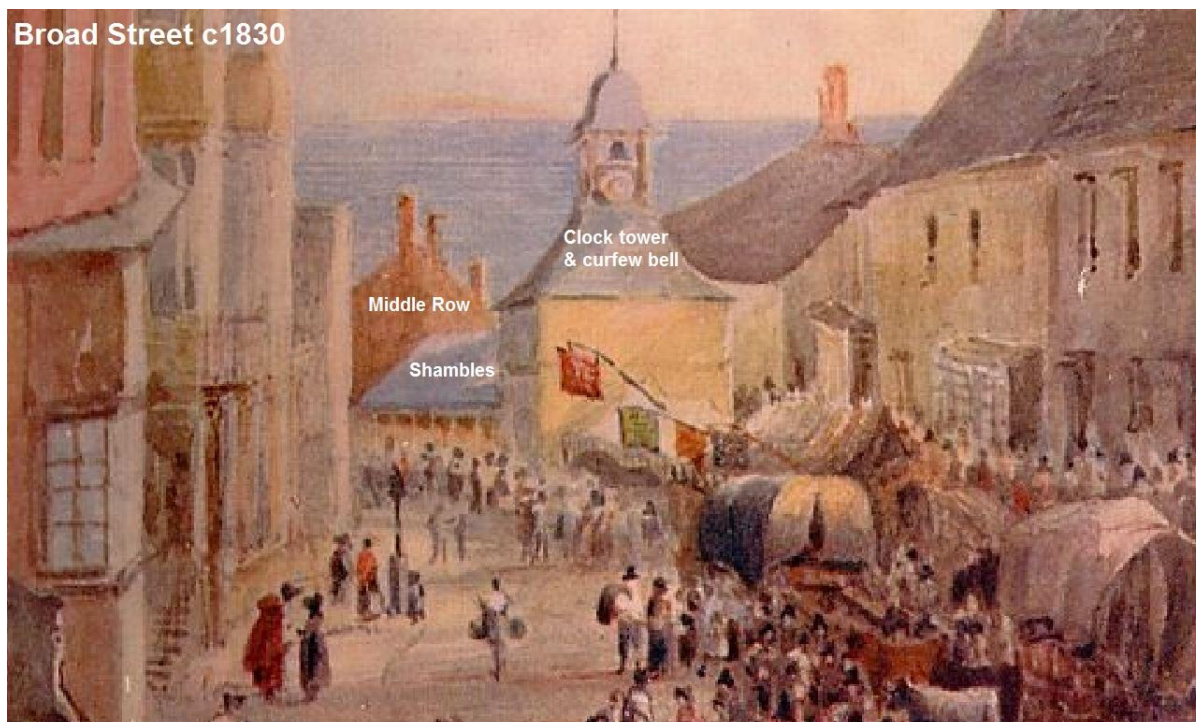
Broad Street c1830

Middle Row is a landmark feature of the town, and is an integral part of the unique view looking down Broad Street towards the sea; a view today that has changed little since the 1850s.